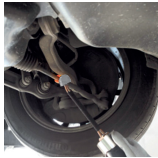
Releases steering linkages