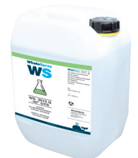
PN. 062511 Welding coolant - 5 l