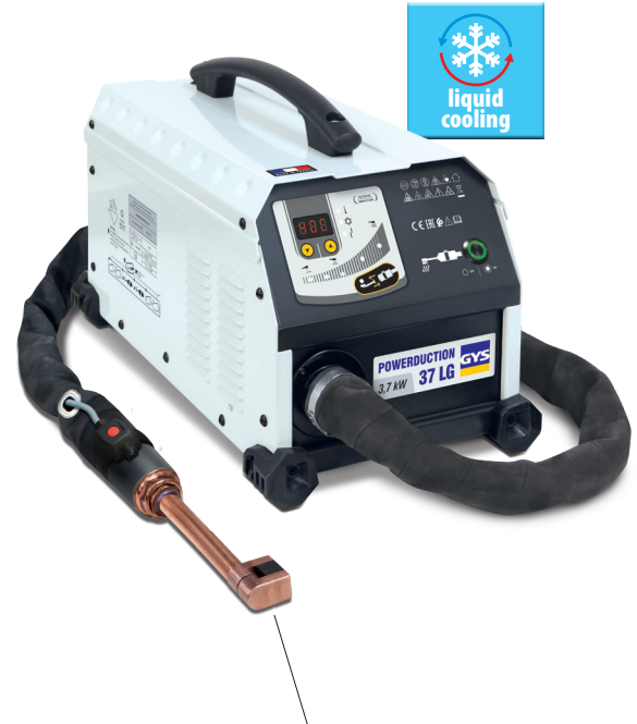
Supplied with a complete inductor 90°