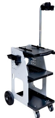
PN. 051331 + 052284 UNIVERSAL 800 + Over hanging arm